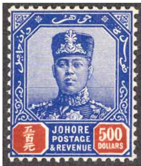
Johore 1922–41 $500 unused – The Crown Agents Collection.

' Malaya in the British Library Philatelic Collections ' is expected to be published by the Malaya Study Group in the spring of 2012. More information including price and ordering will be on the MSG's website: www.malayastudygroup.com