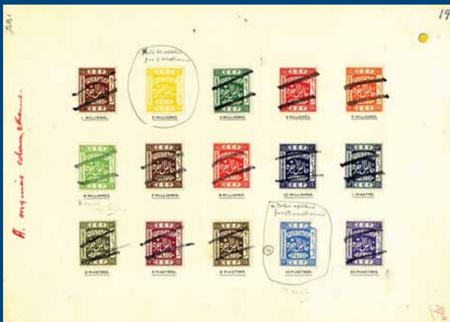
Colour Trials for the 1922 issue.

The Foreign and Commonwealth Office Collection has the 1921–44 issues basically complete unused, including stamps additionally overprinted for use as Consular fee stamps, and for use in Trans-Jordan (1925 onwards, including for revenues), these revenue stamps are rarely seen. So for anyone interested in this fascinating area, there are items from a number of different sources to refer to.