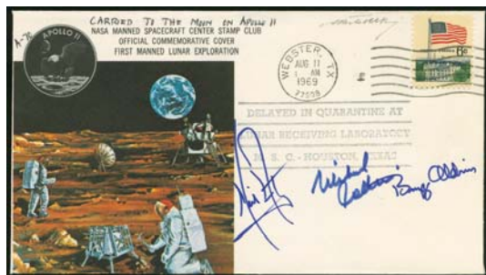
Michael Collins and Edward "Buzz" Aldrin - A.Bolaffi (financial cert. 100% with expertise appendix 1987) lot 145 - BASE 12,000.00