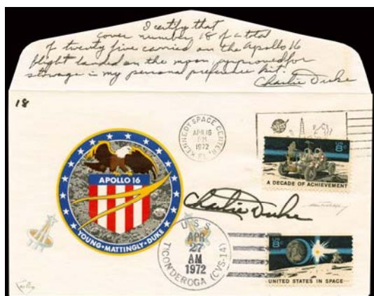
declaration by C.M.Duke issued on 29.7.85 in the presence of an American notary public - A.Bolaffi (financial cert. 100% with expertise appendix 1986) - Enzo Diena (cert.1986) lot 151 - BASE 42,000.00