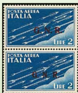
G.N.R. - Air Mail lot 701 base € 450,00