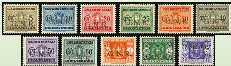
G.N.R. - Postage-due label lot 707 base € 600,00