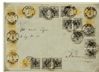
Lombardy Venetia Kingdom - Two colours: those of the Habsburgs, ruling there at the time.