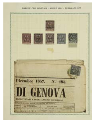
Duchy of Modena