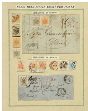
Lombardy Venetia Kingdom