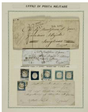
Kingdom of Sardinia