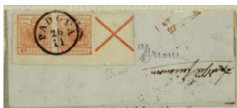
Lombardy Venetia Kingdom - In each sheet, 60 stamps and 4 St. Andrew's Crosses were printed.