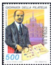
On 20 November 1987 Italy paid tribute to him with a 500 lire postage stamp.