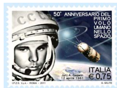
The cover signed by Jurij Gagarin and the Italian postage stamp devoted to him.

Flight Festival, ex area Expo of Rho (Milan) - From hot-air balloons to drones, great evidence has been given to Space mail and to the way philately can testify our history . Among the different items, one cover signed by the first astronaut, Jurij Gagarin, and the Italian postage stamp devoted to him. It is the 75 centimes issued on 12 April 2011; it is interesting above all for its symbolic value: it celebrates the 50 th anniversary from the first human flight in Space.