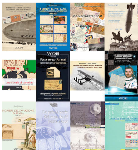
Some of the volumes relevant to flight available by Vaccari srl.