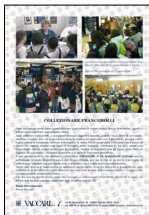
One of the folders given to children as a present.