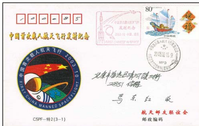
China 2003 Cover of the first Chinese human flight.